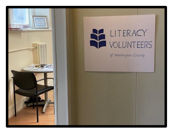
Follow the hallway to LVWC.