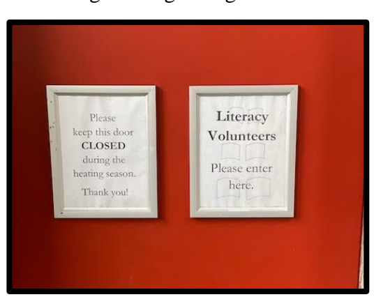
Walk through the red door.