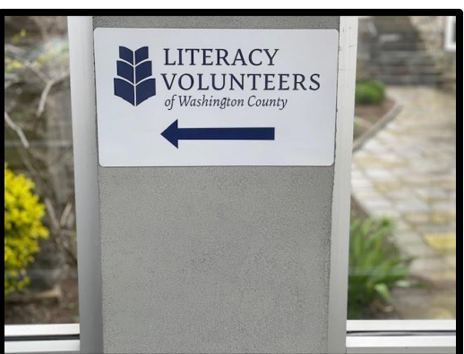
After you walk through the glass door, turn left.